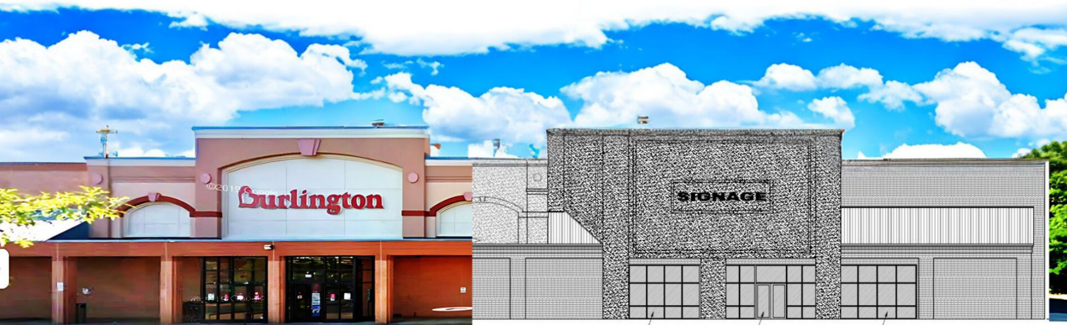
New Store Front Rendering